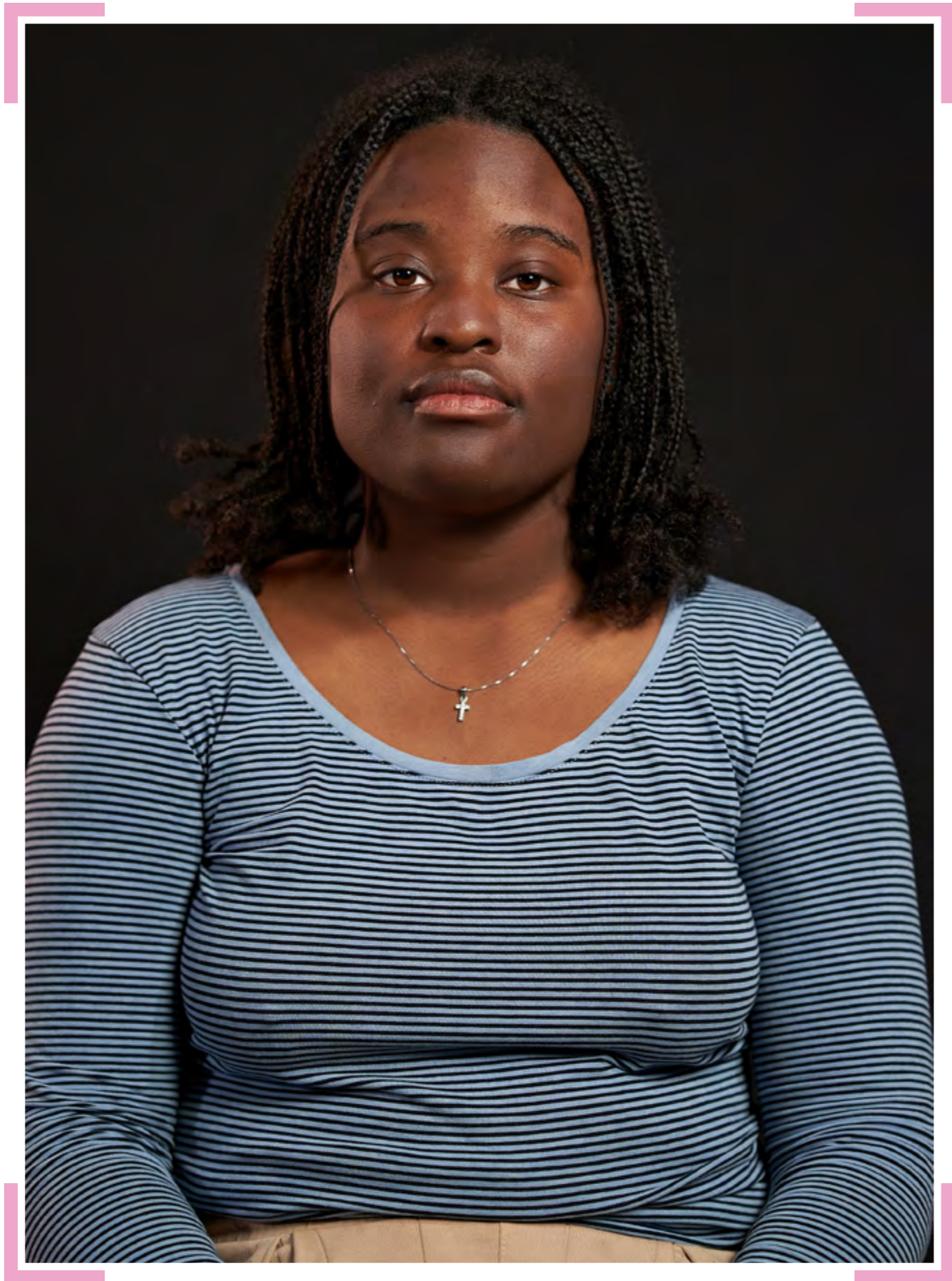
Romance Bassingha 20, Germany